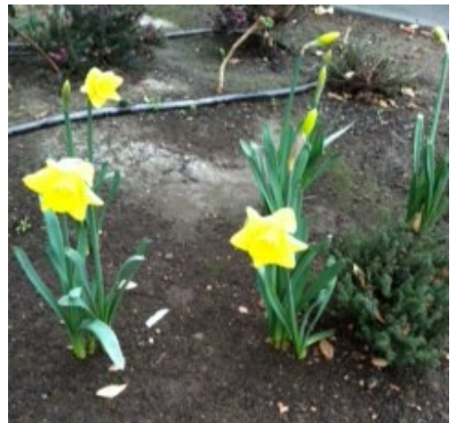
Daffodils, the "Harbinger of Spring" growing Jan 27 between the church and Town Park Towers.

"God writes the Gospel not in the Bible alone, but also on trees, in the flowers, clouds and stars."