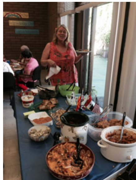
The church family appreciating a good meal together